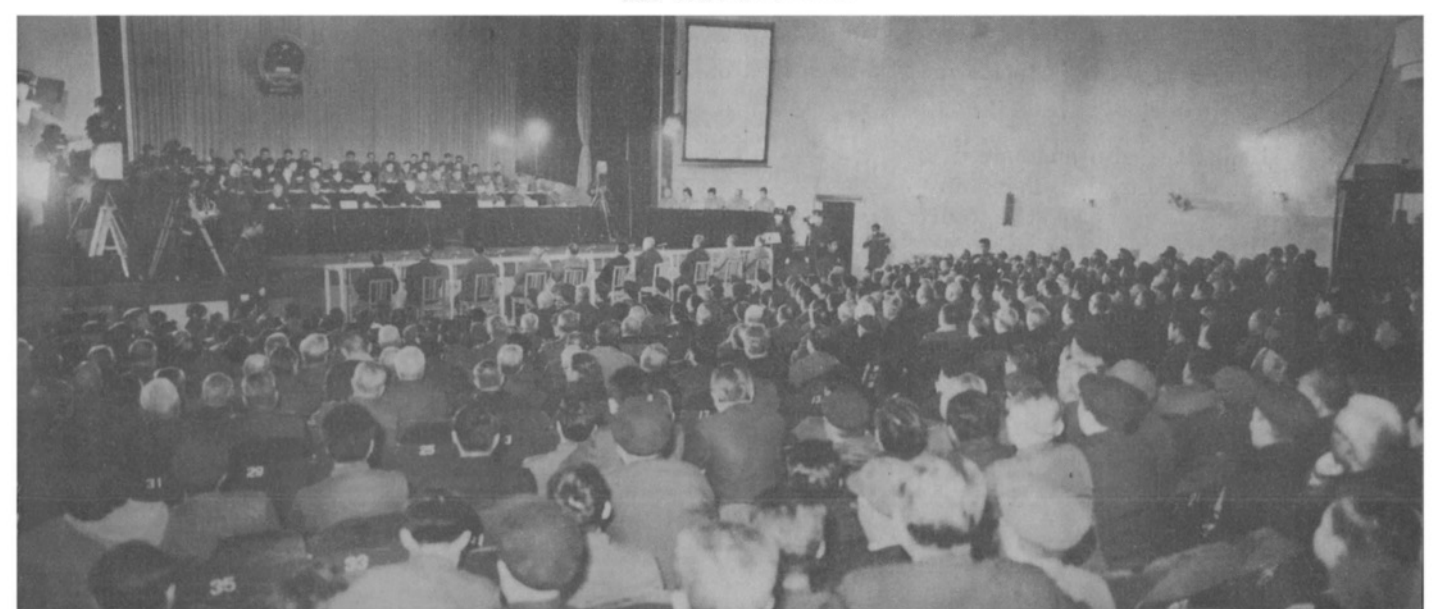
The court in session.

"In accordance with the provisions of Article 9 of the Criminal Law of the People's Republic of China with regard to the application of law," the indictment says, "this procuratorate affirms that the ten principal culprits have violated the Criminal Law of the People's Republic of China and have committed the offence of attempting to overthrow the government and split the state, the offence of attempting to engineer an armed rebellion, the offence of having people injured or murdered for counterrevolutionary ends, the offence of framing and persecuting people for counter-revolutionary ends, the offence of organizing and leading counter-revolutionary cliques, the offence of