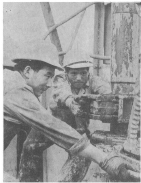
Working at a new oilfield.

In the last few months, our geological prospectors discovered indications of new oil and gas sources in some areas in the northwest, southwest and north China and off the coast. Their discoveries further verify