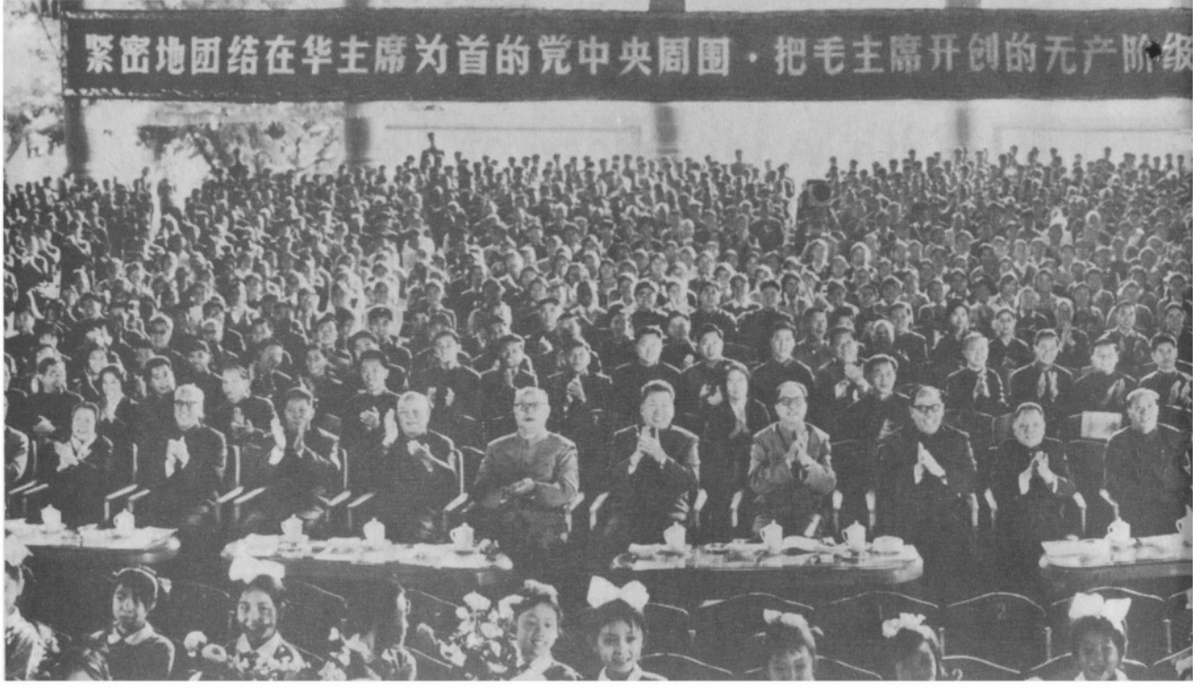
Chairman Hua and other Party and state leaders and the distinguished Kampuchean guests join the Peking citizens in celebrating the National Day in Chungshan Park.

they toasted the growing revolutionary friendship and unity between the Chinese people and the people of other countries.