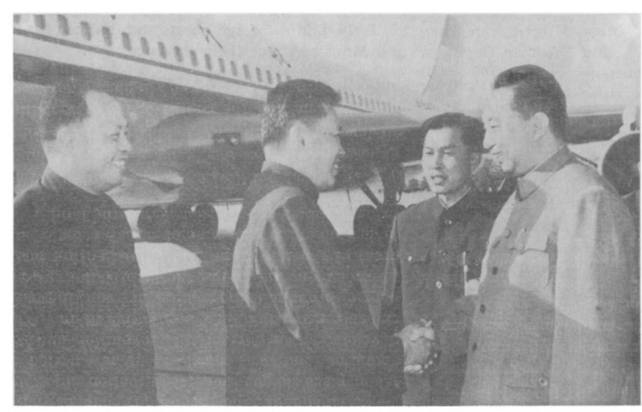
Comrade Hua Kuo-feng and Comrade Pol Pot at the airport.

banquet. (For full texts of their speeches see pp. 20 and 22.)