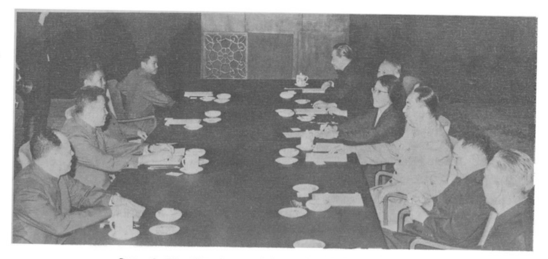
Comrade Hua Kuo-feng and Comrade Pol Pot holding talks,

The Kampuchean Party and Government Delegation headed by Comrade Pol Pot successfully concluded its official friendly visit to China and left